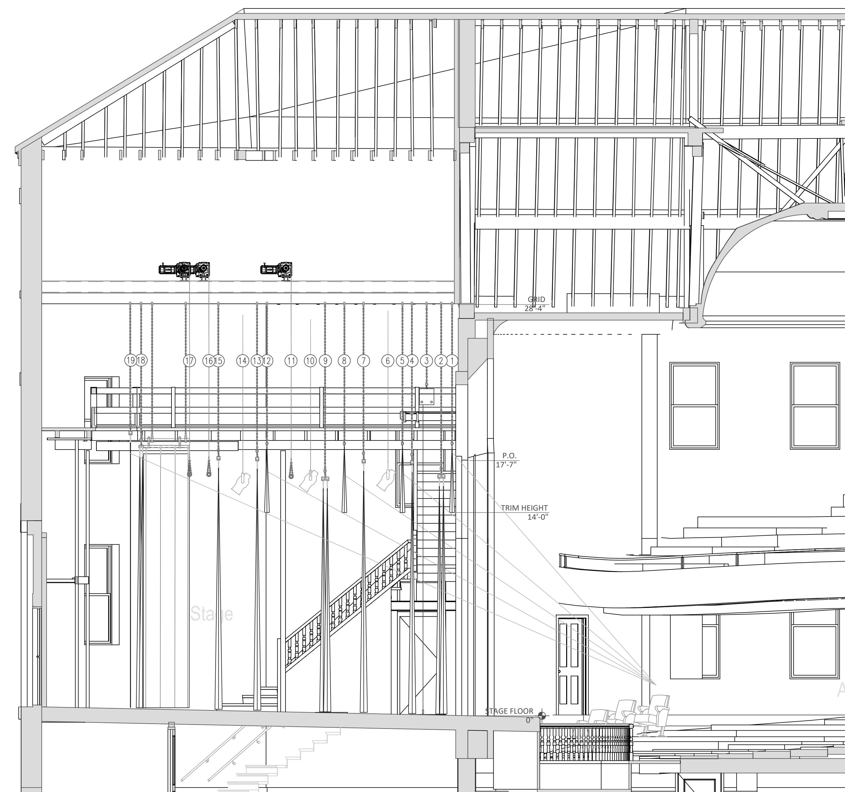
STAGE SECTION SCALE: 1/4"=1'-0"